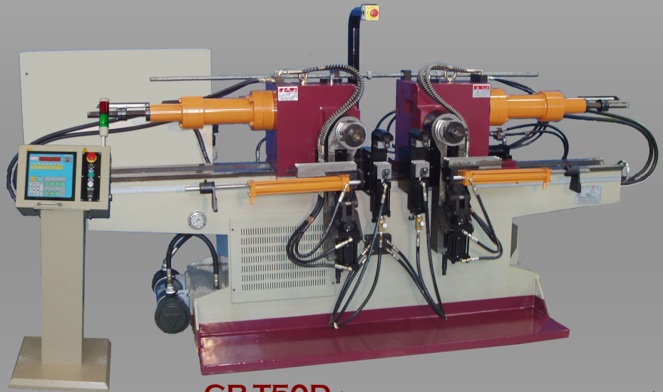
CR-T50D (SHOWN W/ OPTIONAL SAFETY PACKAGE)