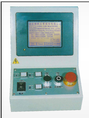
Touch-screen Control Panel

Note: Technical data and machine design subject to change without notice.