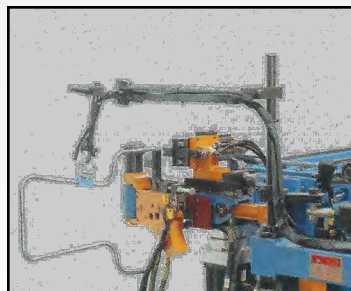
Auto. Load/Unload (Optional)