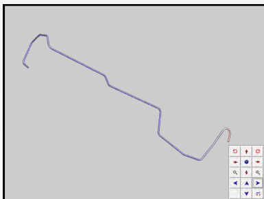
3D Part Visualization