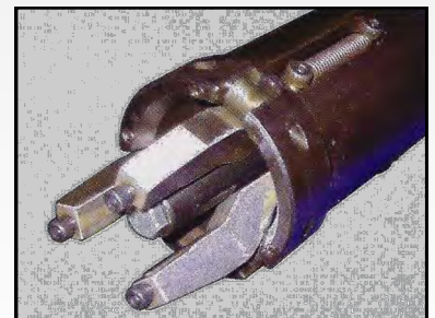
3-Jaw Collet (Optional)